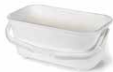
Item A0046 (Available in case of 3)

We've scoured the planet looking for the 'World's Best' graffiti removal applicators, suitable for applying our products. They're long lasting, chemically resistant and guaranteed to make your job a whole lot easier.