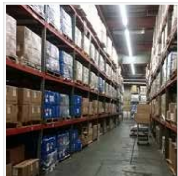
Urban Restoration Group US Inc Factory & Warehouse, Los Angeles CA