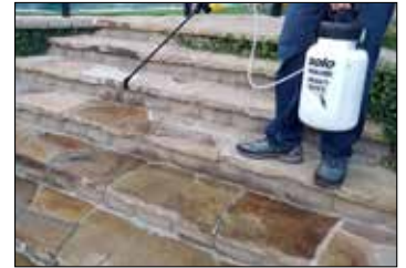
Ideal for natural stone that appears wet with water