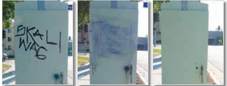
Removes ink stains from coated and painted surfaces.

1 Quart: Item WB0032 1 Gallon: Item WB0030 5 Gallon: Item WB0031