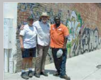
Demonstrations, Expert Training & Advice.