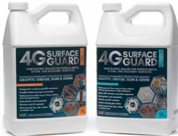
1 Gallon Walls: Item WB0152