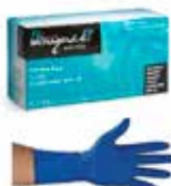
Item A0140 (Available in case of 50 & mastercase of 500)

Ideal for all brush-on / wipe-off applications or for flood coating our removers onto walls before pressure washing.