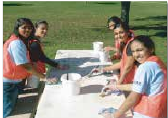
Community clean-up event Riverside, CA

(Available in cases of 12. Custom Labeling available upon request).