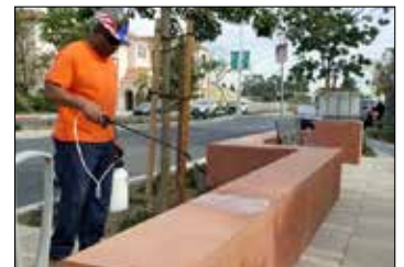
Used in high value, high traffic locations