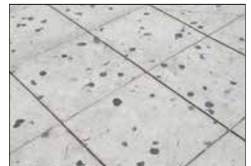
Makes cleaning gum easy, and prevents gum ghosts

4G Surface Guard makes porous walls or floors easy to clean without altering appearance.