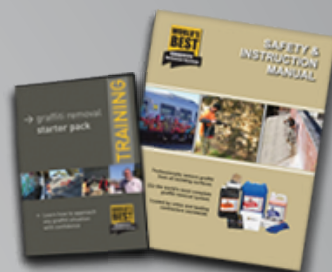
Training DVD & Manual included with every Starter Pack.