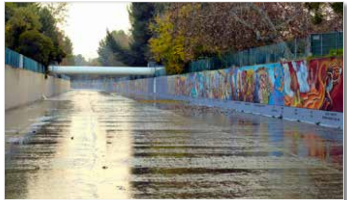
'The Great Wall of Los Angeles' © Judy Baca (the world's longest mural)

1 Gallon: Item WB0130 5 Gallon: Item WB0131