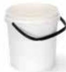
Item A0040 (Available in case of 12)

We love these handy buckets so much that we bring them in from Australia. Perfect for brooming up our removers on sidewalks, walls and concrete skate park bowls. Low profile allows for dragging along the ground. Square shape and compact design fits perfectly in the back of your truck.