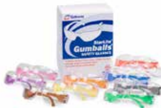
Item A0100 (Available in case of 10 & mastercase of 100)

Fits either hand, and is extra long and durable (8mm thick). Available in size XL only, which works best for everyone.