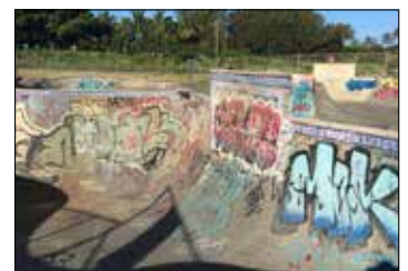
Can be used to protect horizontal surfaces, such as skate parks