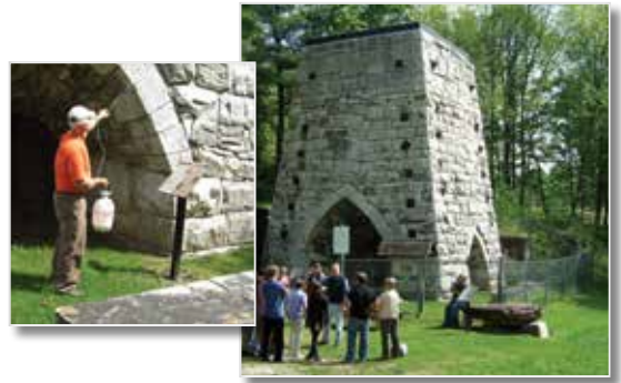
Friends of Beckley Furnace apply World's Best Graffiti Coating.

World's Best Graffiti Coating works in conjunction with MuralShield by offering long lasting protection for murals and artworks. See data sheet for further details.